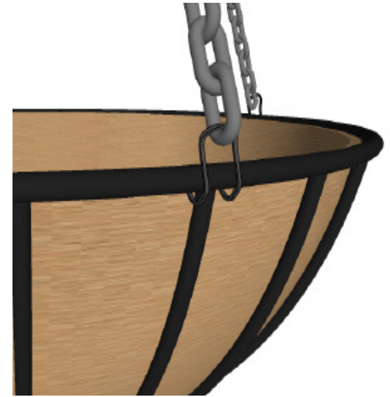
BASKET ATTACHMENT DETAIL